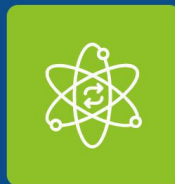
Made with Advanced Latest Technology