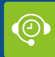
Excellent After Sales Service