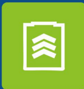
High Storage Capacity