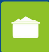
Best Raw Material base